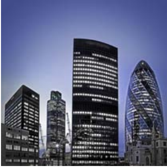
ar034 | 13 445 KB