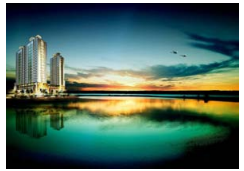
ar024 | 8 594 KB