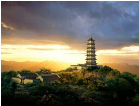
ar022 | 9 228 KB