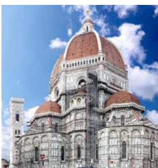
ar013 | 21 510 KB