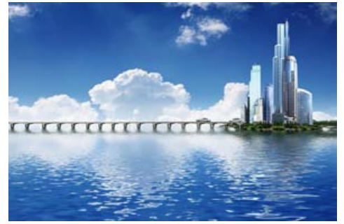
ar021 | 20 968 KB