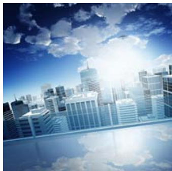
ar044 | 8 056 KB