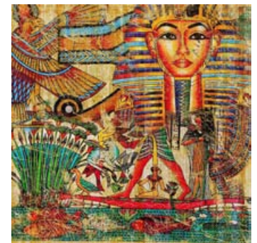
ar09 | 14 693 KB