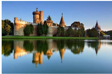
ar05 | 8 757 KB