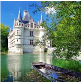
ar01 | 11 906 KB