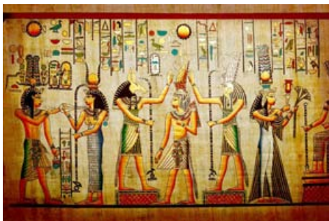
ar07 | 11 211 KB