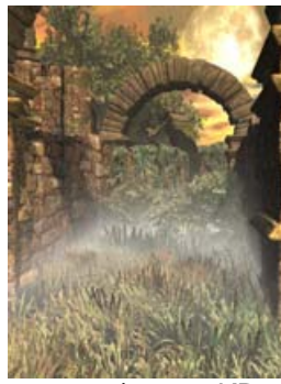
ar032 | 1 310 KB