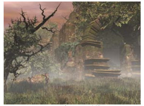
ar033 | 1 239 KB