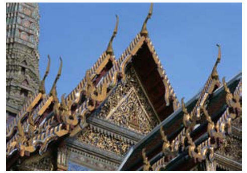
ar039 | 1 735 KB