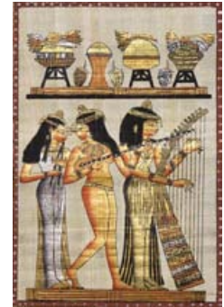
ar06 | 5 577 KB