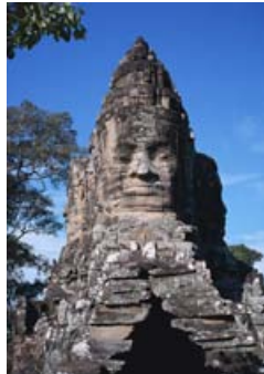
ar041 | 1 694 KB