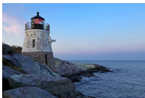
ar029 | 8 991 KB