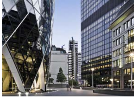
ar035 | 9 481 KB