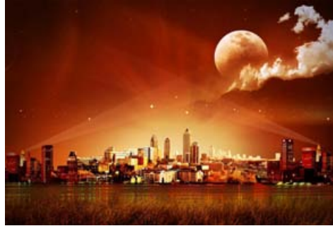
ar020 | 11 377 KB