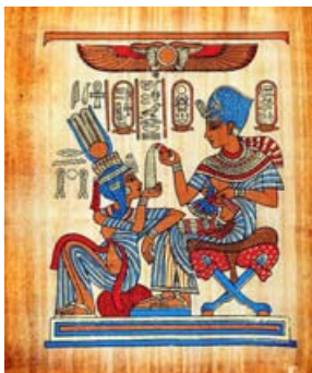
ar010 | 5 787 KB