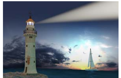
ar027 | 5 706 KB