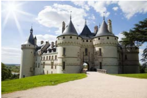
ar04 | 10 295 KB