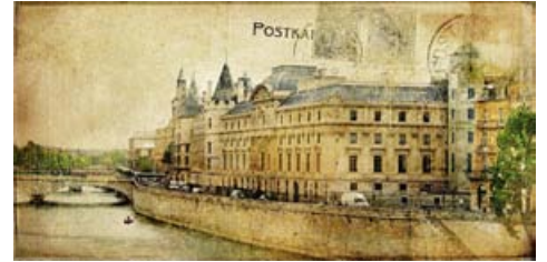
ar018 | 10 580 KB