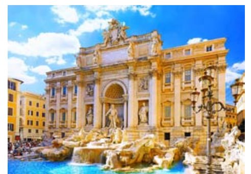
ar015 | 31 177 KB