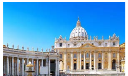
ar012 | 26 318 KB