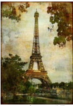
ar016 | 8 853 KB