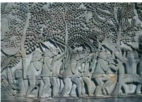
ar043 | 2 135 KB