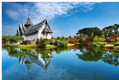
ar026 | 26 510 KB