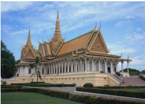
ar040 | 1 212 KB