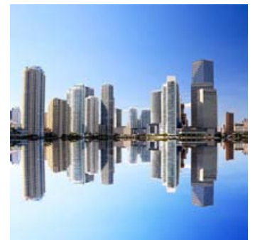
ar045 | 5 742 KB