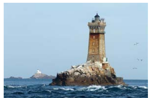
ar030 | 8 694 KB