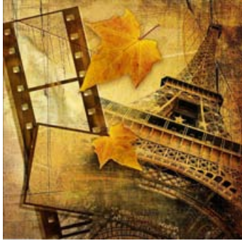
ar019 | 14 331 KB