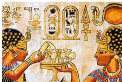
ar08 | 8 906 KB