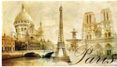
ar017 | 10 296 KB