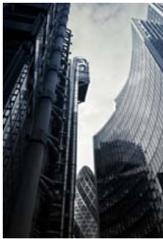
ar037 | 10 622 KB