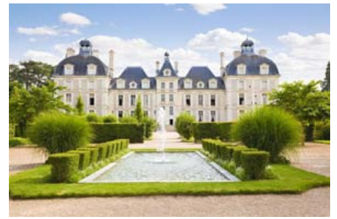
ar03 | 13 667 KB