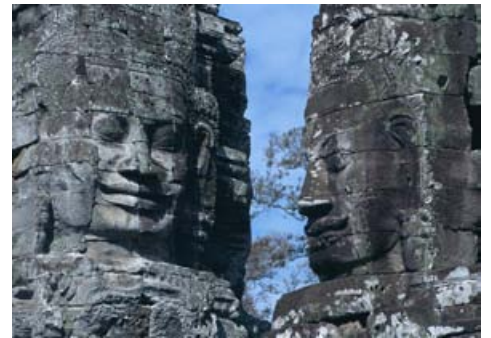
ar042 | 1 748 KB