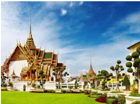
ar025 | 27 602 KB