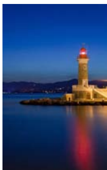
ar028 | 8 613 KB