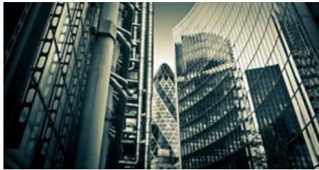
ar038 | 22 727 KB