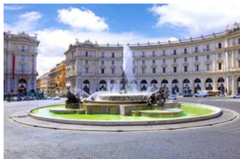
ar011 | 15 796 KB