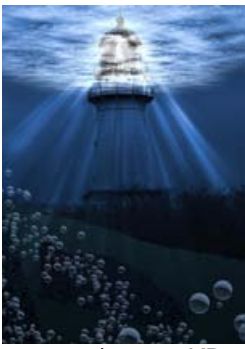
ar031 | 7 600 KB