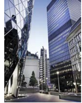
ar036 | 8 035 KB