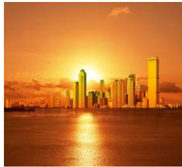
ar023 | 18 147 KB