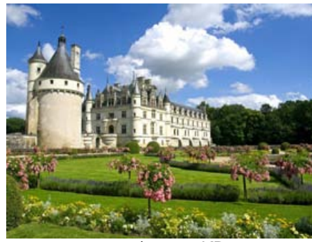
ar02 | 8 201 KB